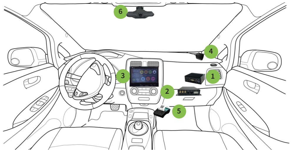
Figure 1: Advanced Taxi Solution setup

It also provides transport authorities and operators with a comprehensive operational overview, including detailed business intelligence and insights to enable significant business improvements.