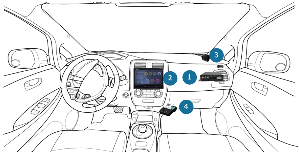
Figure 2: Intermediate Taxi Solution setup